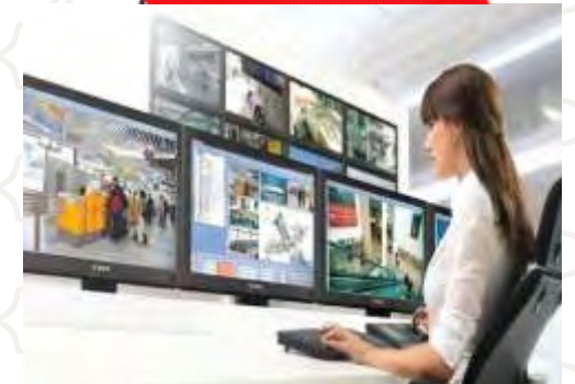
Safety & Security