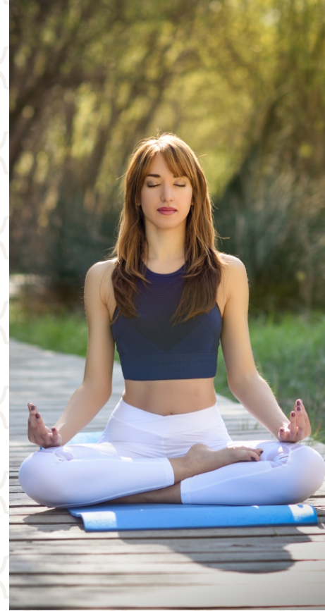
YOGA & MEDITATION CENTER

EXPERIENCES FOR ONE & FOR ALL विश्वास की नींव